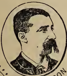
SIR. A.P. CARON.